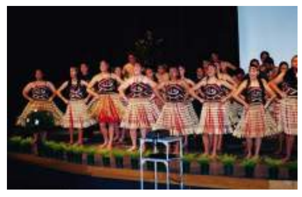
Students from Hoani Waititi Marae